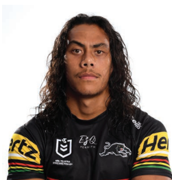
6. FIVE-EIGHTH JAROME LUAI